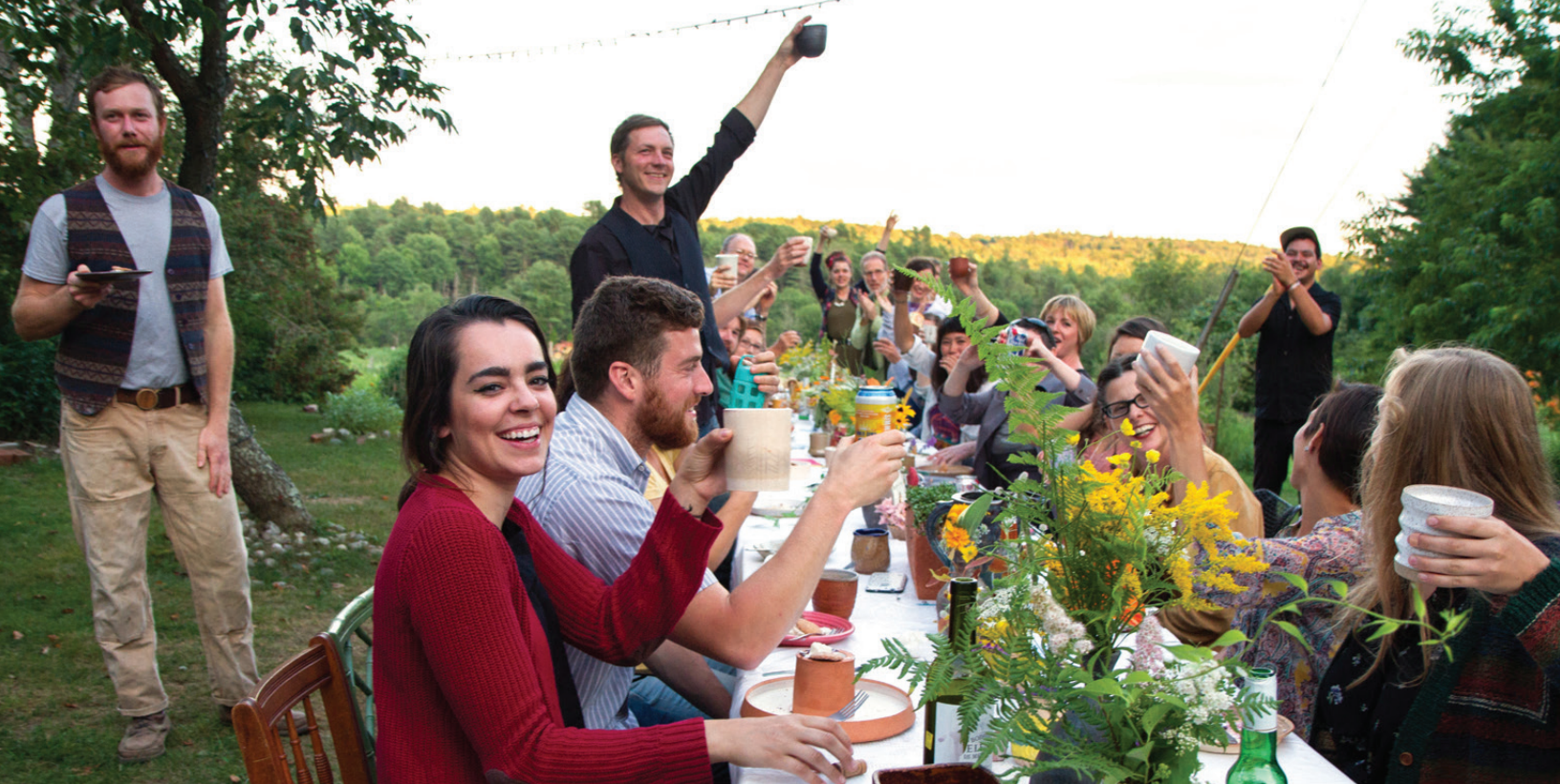
Artists celebrate during the local food feast and tableware exchange.