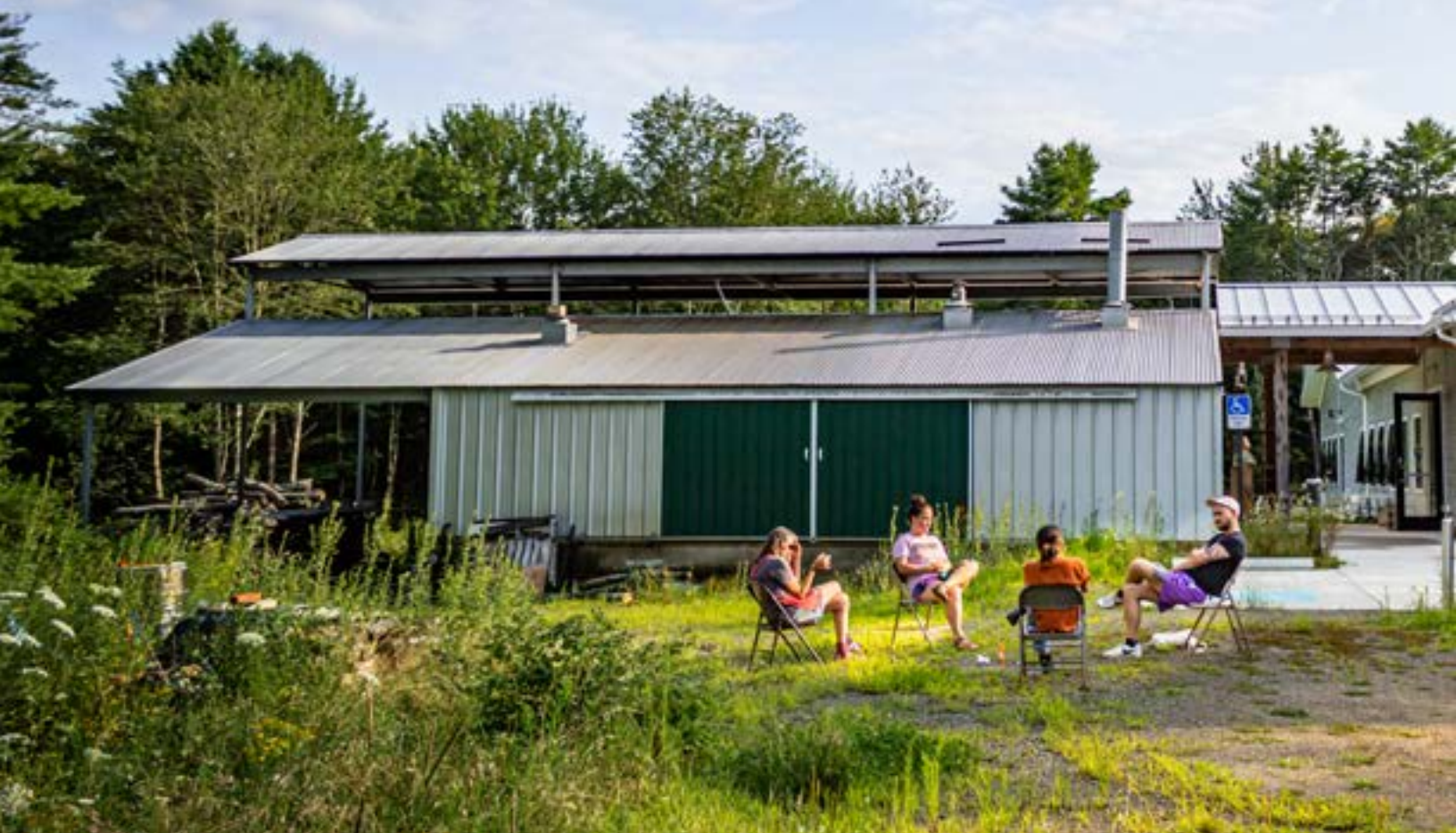
Session V artists take a break from working in the Windgate Studio during a warm summer afternoon.