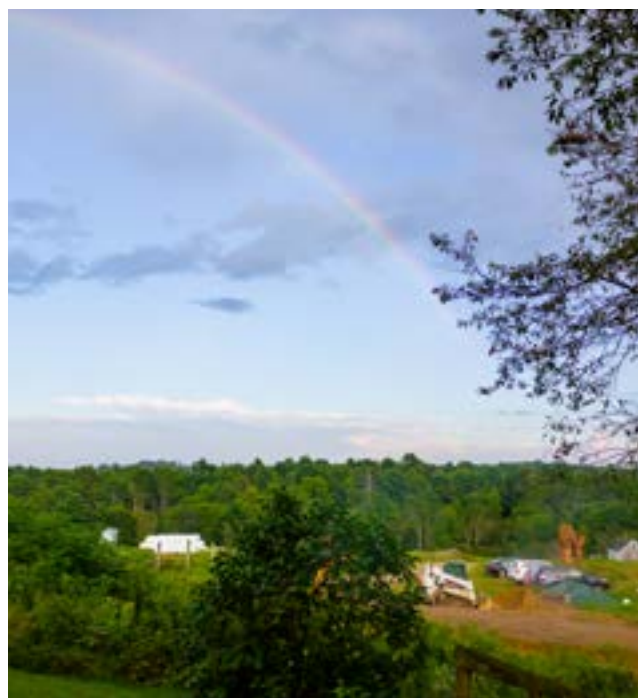
A double rainbow appears on the horizon over Watershed's campus..