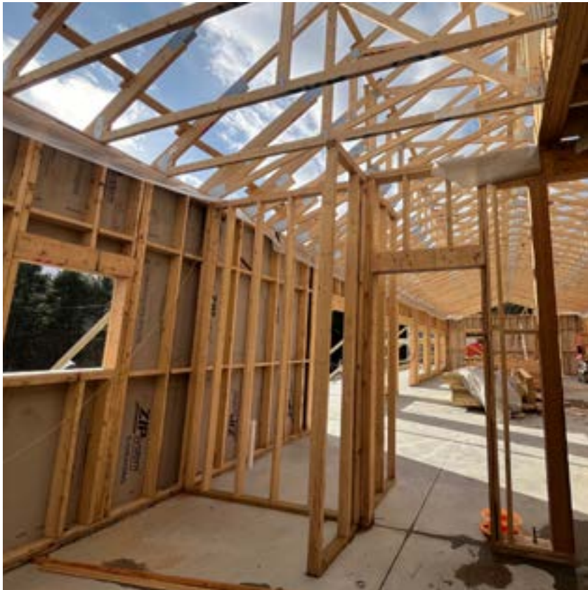
3. Framing is erected in what will be the state-of-the-art commercial kitchen.