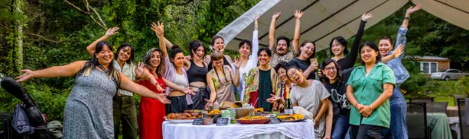
Session VI: Collectivity artists gather around their community dinner.